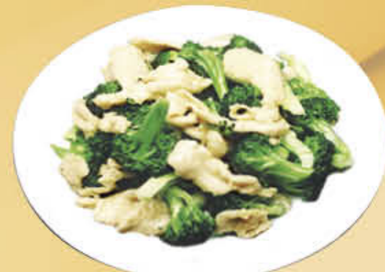
Chicken w. Broccoli