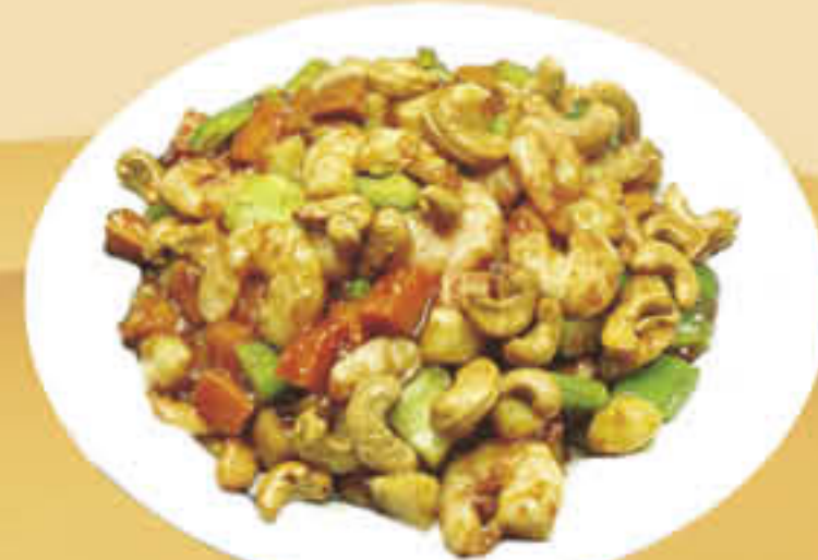
Chicken w. Cashew Nuts