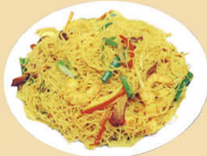
Singapore Mai Fun