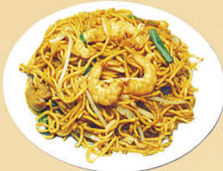
Shrimp Lo Mein