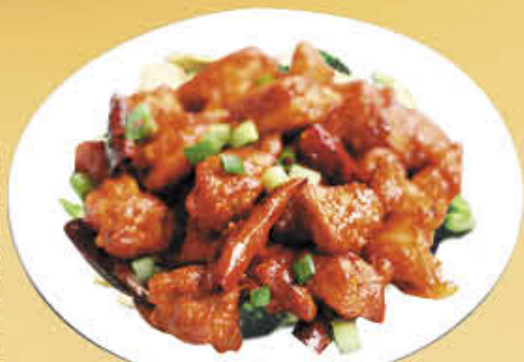
General Tso's Chicken